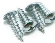
Self-tapping screw for CB fixing 4pcs