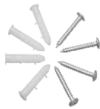
Self-tapping screw and expand plug for CB wall installation 4pcs