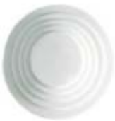
2P PG connectors

Option installation accessories (cost will be different based on the accessories) :