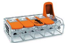
Cable clip as required